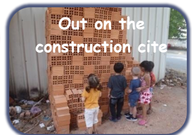
Out on the construction site