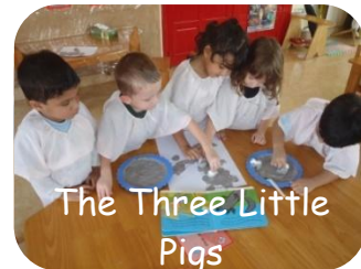
The Three Little Pigs

Lynn@smartkidsinfo.com www.smartkidsinfo.com