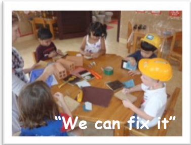
"We can fix it"