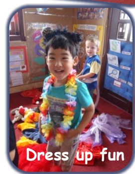
Dress up fun